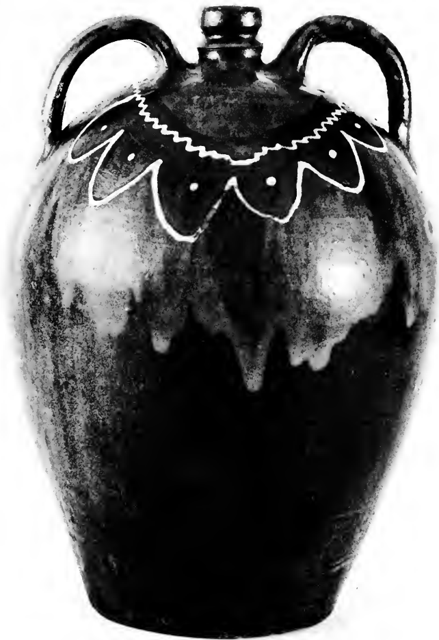
Jug by the Phoenix Factory; alkaline-glazed stoneware; Edgefield area, S.C.; 1840-1842. HOA 16 \frac{5}{8} ". MESDA acc. 1054.3.